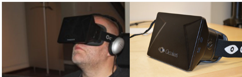
Figure 3: Oculus Rift used by one of the authors

The assumption in this experiment is that the participants are not experienced with the scenarios being presented to them and most likely never set foot in any similar situation. We provide a short tutorial explaining the main controls, input devices, components, and processes. We support different control options as it is important that the participant feels comfortable. Next to specialised input devices like Sixsense Motion control and Kinect, we also offer the traditional mouse and keyboard option; however, the output device is determined by the experimental design (Table 1). The experiment is not about training or evaluating experts doing occupational health and safety inspections; rather, the focus is on how people in general react to the space depending on the use of different media formats, the usability and interactivity of the scenario and an understanding if there is a common sense or general capability to identify dangerous situations. These factors are all relevant on site visits with students. This paper covers the experimental design including the input and resulting output to derive a formative feedback for the participant and a first evaluation of whether this context is feasible for