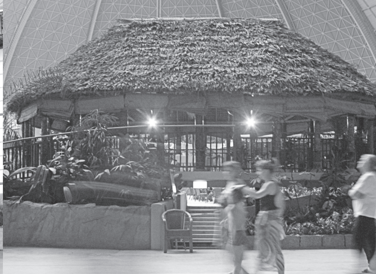
Samoan Fale. Photo: Sylvia Henrich, 2007.