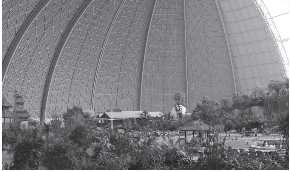
Tropical Islands Management GmbH

9. Some confusion prevails about what the “indigenous areas” are: a Sunday Times reporter believes the restaurants are of “Thai, Malaysian and Indonesian architectural style” or, simply, “oriental”. These exotic spaces are further interiorised by filling them with homely elements, for instance with “plenty of German beer and wurst” (Eames, 2006). A global space for the public is created and filled with meaning in ways reminiscent of DiPaola’s tropes.