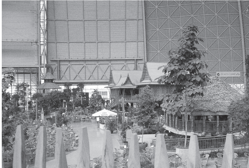
Samoan Fale in the Tropical Village.

episodes constantly demand to be taken as one's own personal fantasies and dreams. Productive distance is obliterated, and the conflict between what can and cannot be said is suppressed.