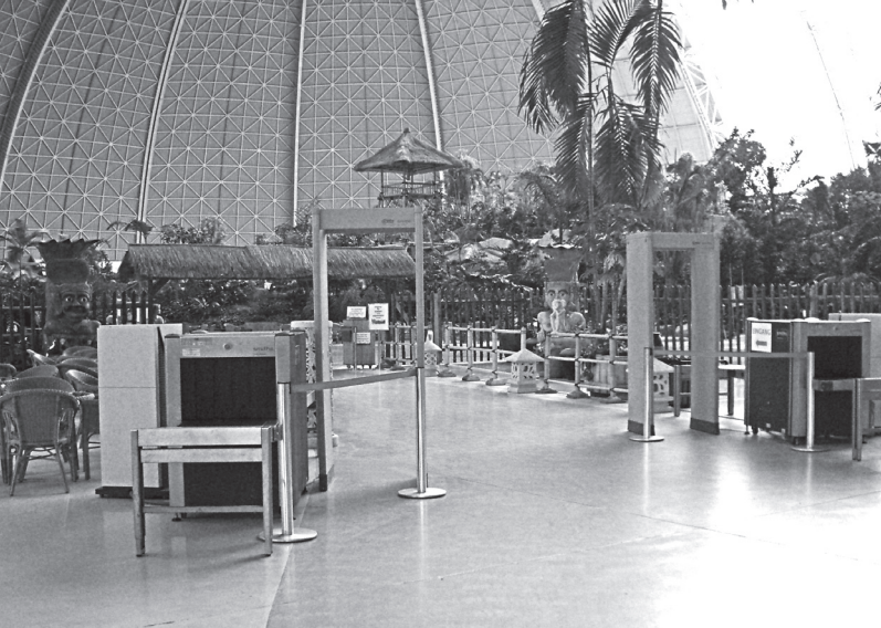
Entrance flanked by x-ray machines. Photo: Author, 2006.