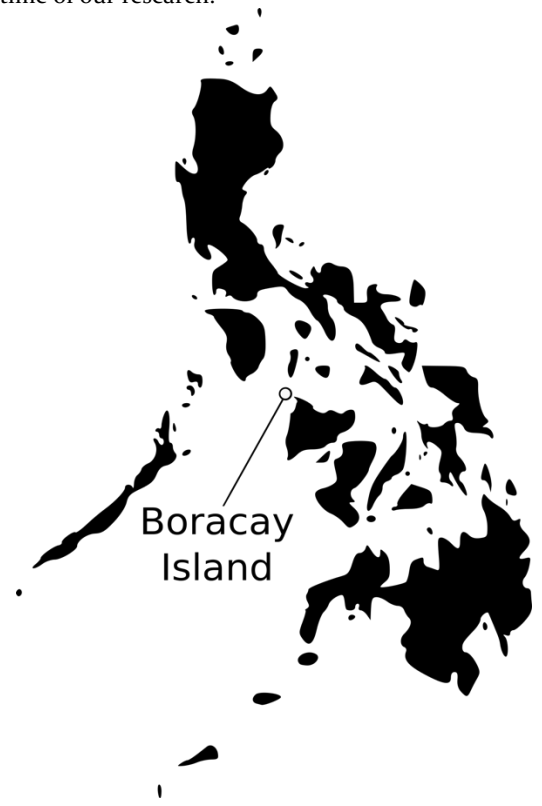
Figure 1 - Map of the Philippine archipelago showing location of Boracay