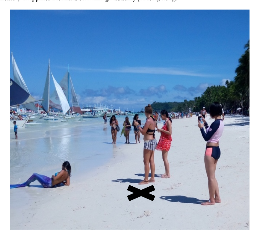
Figure 2. Example of a mermaid photo shoot. The participant is directed by the mermaid instructor (indicated with an X) to lie in various poses while the PMSA instructor/employee (shoots photos with the participant's own device.

Notes: IMSIA=International Mermaid Swimming Instructors Association. *The Introduction to Mermaid Swimming is also available as a private lesson. **Prerequisites include: PADI certified SCUBA diver or certified freediver, IMSIA Levels 1, 2, and 3, Water safety training certification. ***Prerequisites include: PADI certified SCUBA diver or certified freediver, IMSIA Levels 1, 2, and 3, CPR and First Aid certificate (Philippines Mermaid Swimming Academy [PMSA], 2014).