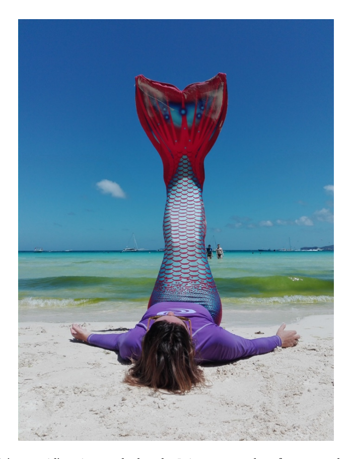
Figure 2 - A 'mermaid' posing on the beach. It is commonplace for passers-by/tourists to take photos of the activity despite having no involvement in the activity and/or relation to the mermaid participant.